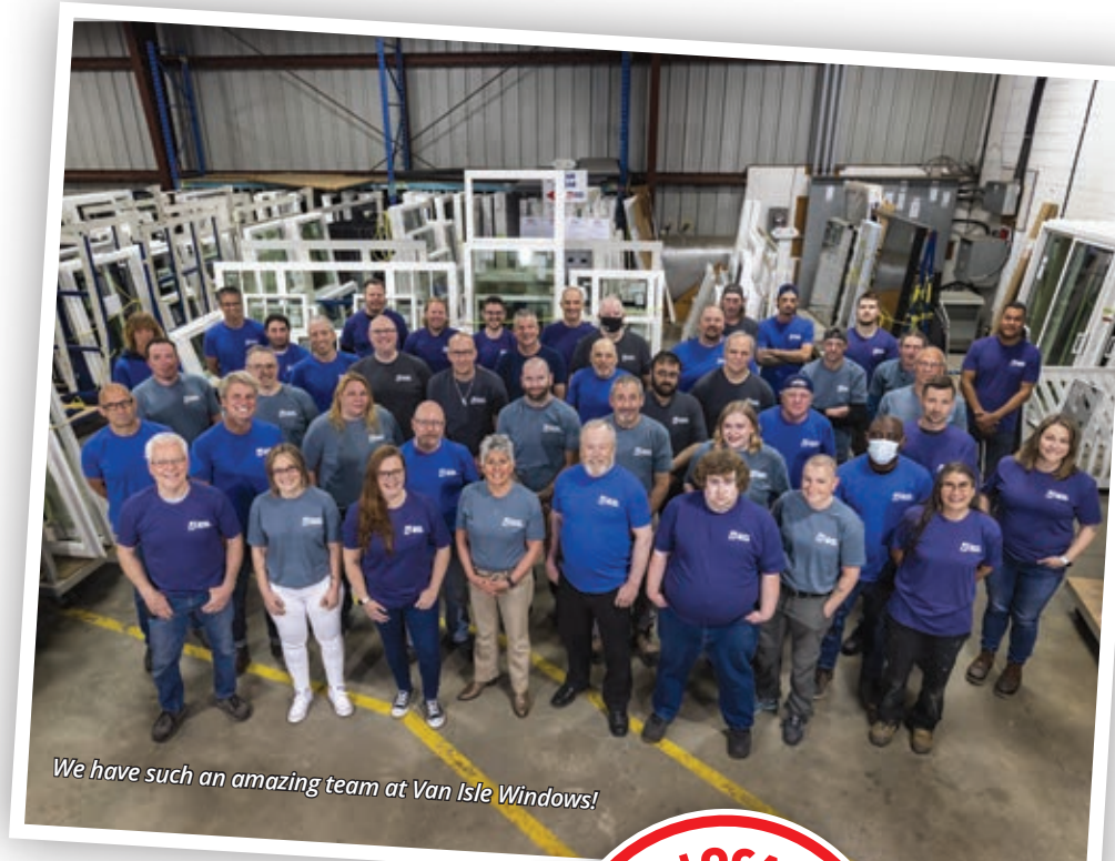
We have such an amazing team at Van Isle Windows!

Manufacturing and installing windows on Vancouver Island and the Gulf Islands for 45 years!